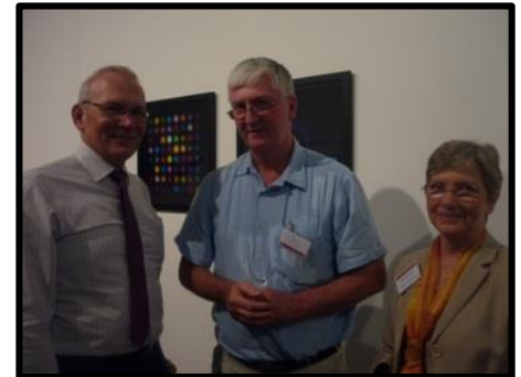
QCA Art Gallery, University Librarians' Forum