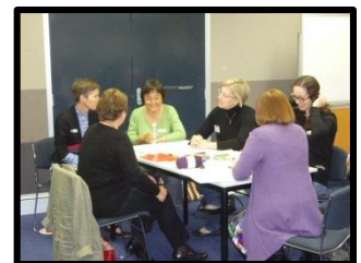
Group Work, Design Thinking Workshop, QUT