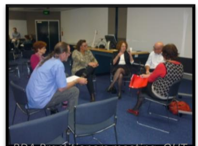
RDA Practitioners meeting, QUT