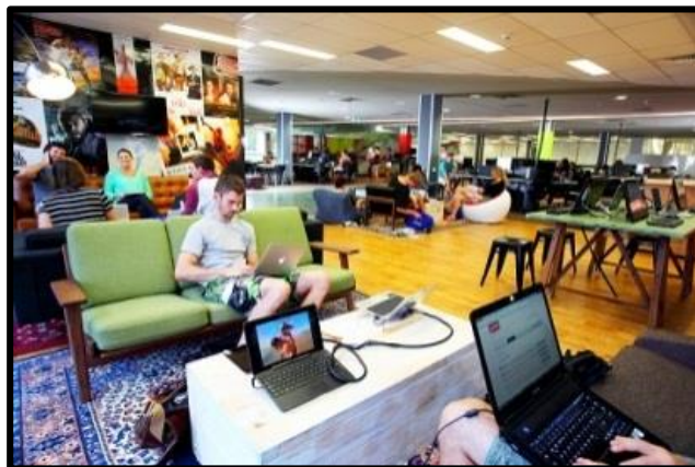
Griffith University, Gold Coast Campus Library