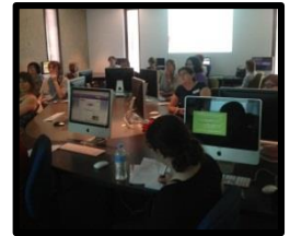
Bibliographic Software Masterclass, UQ